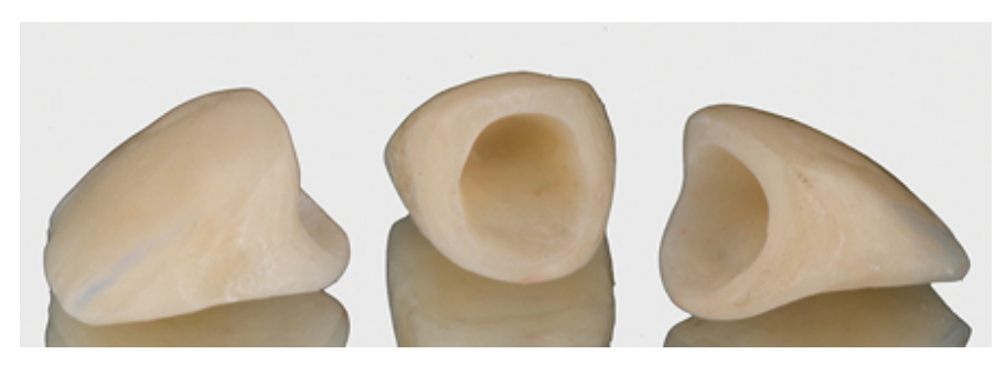
The new temporary crown margin with a new shape and form, is positioned in the sulcus, no deeper than 0.5 to 1 mm, fully respecting the