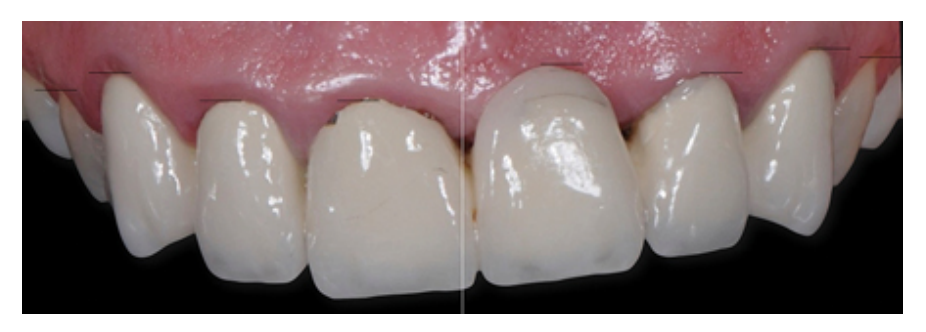
C. Altered gingival architecture.