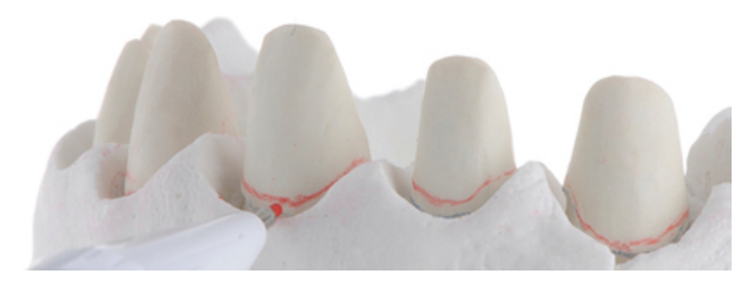
A red mark is traced with a 0.5 mm pencil over the gingival contour projecting it on the abutment's wall (red line).

When the apical part of the model is exposed, it will be marked with a blue line. The area between the two lines, the red and the blue ones, is called the "finishing area" and within this area we create the final crown margin ( Fig. 11 ).