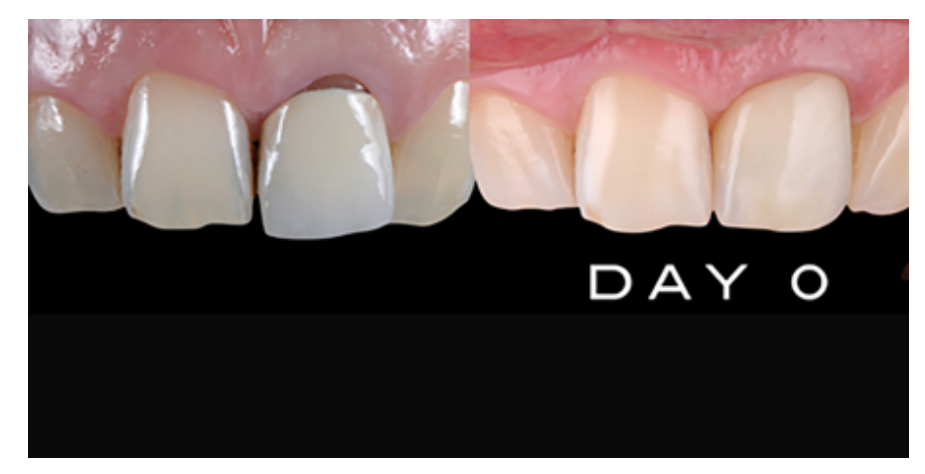
Initial gingival margin.