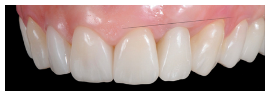
Gingival adaptation around new form and profile.