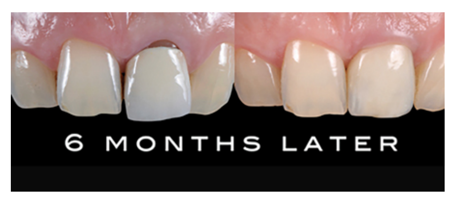
Final gingival margin adaptation.